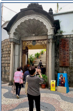
Walking up to St Joseph's Church