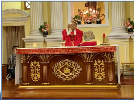
A special mass for CWL pilgrims at Our Lady of Mount Carmel