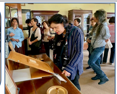
At St Joseph's seminary and museum