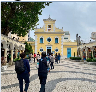
Church of St Francis Xavier