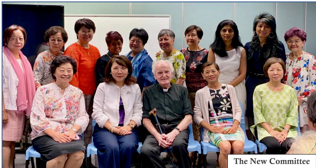
The New Committee