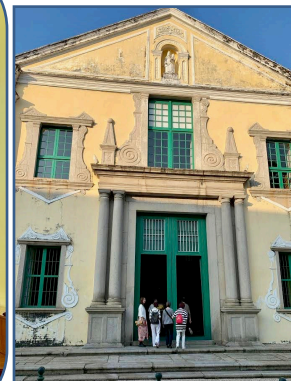
St Augustine Church