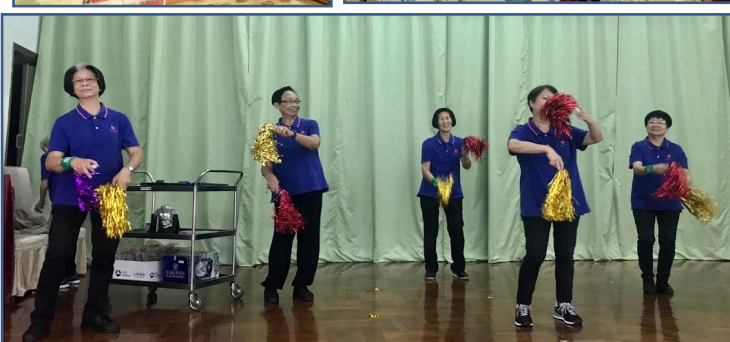
Wai Yin Elderly Volunteer Group perform at St Mary's

CWL's Bingo sessions have an interesting history, dating back to St Mary's Home in 1988. They were started with the intention of getting residents out of the comfort of their rooms. Thirty years on, the sessions still form an intrinsic part of our monthly activities.