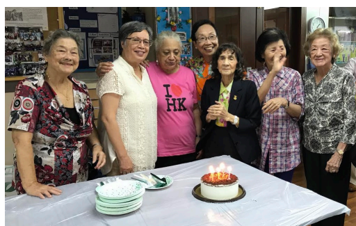
Seen with the June and July b'day girls at her last CWL birthday celebration in July 2017