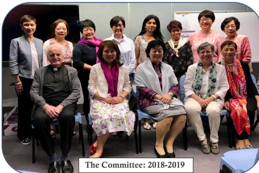
The Committee: 2018-2019