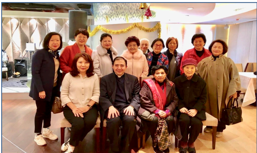
13 Dec: Clicked after a CWL fellowship lunch at the Chariot Club